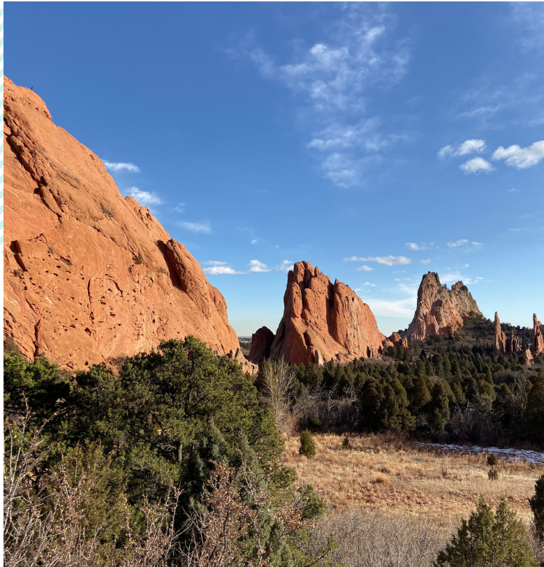
View From the Road: Garden of the Gods, Colorado Springs.

We evaluate and offer feedback for early childhood programs across Colorado to provide high-quality opportunities for children and families.